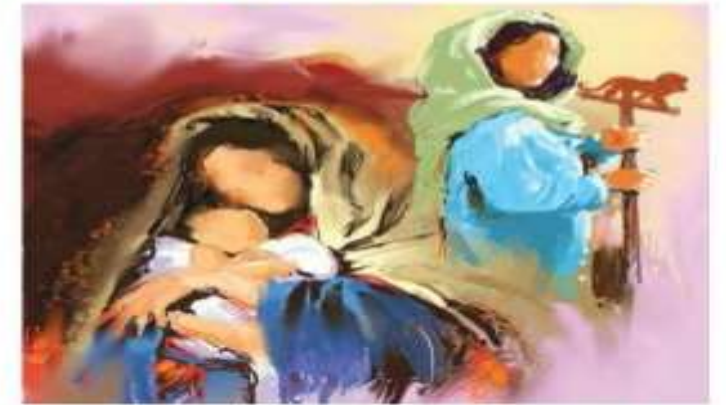
A Bible Study on the Untold Stories of Advent

Dec. 17th - Bathsheba 2 Samuel 11-12, Kings 1&2 Dec. 24th - Mary - Matthew 1&2 Dec. 24th - Christmas Eve 7:30pm - Candlelight Service Dec. 25th - Midnight Celebration - Island of Misfit Toys