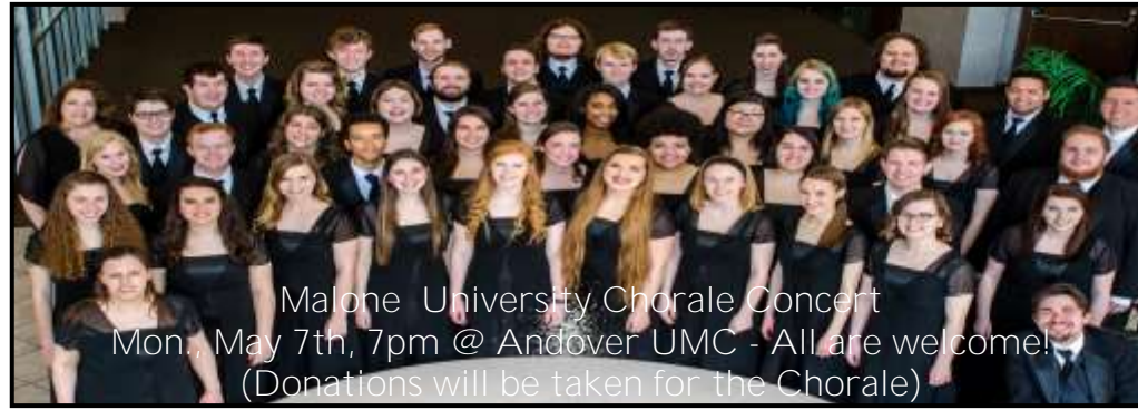
Malone University Chorale Concert Mon., May 7th, 7pm @ Andover UMC - All are welcome! (Donations will be taken for the Chorale)