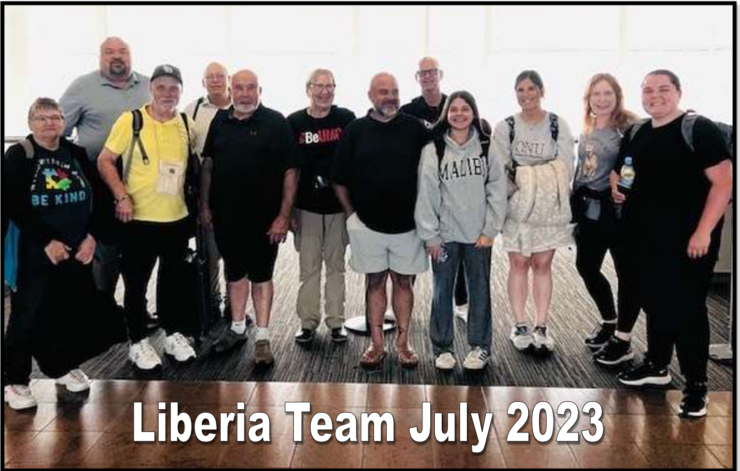
Liberia Team July 2023